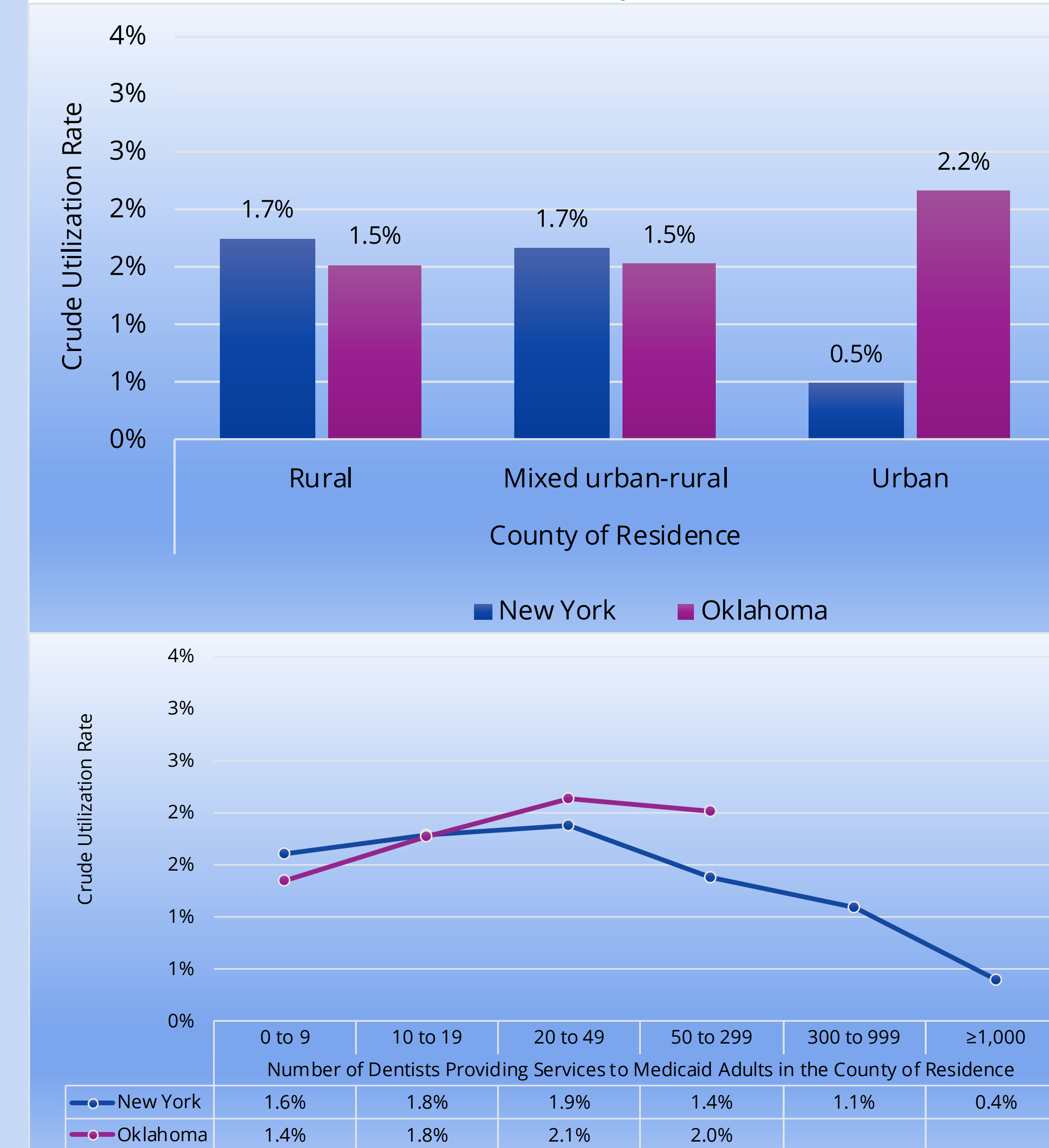
Figure 2. Medicaid Utilization Rates for Dental Services in EDs Among Adults 21 Years and Older Urban-Rural Status of the County of Residence and Number of Dentists Serving Medicaid Enrollees in New York and Oklahoma, 2012-2013

In 2012-2013, Medicaid-enrolled adults in Oklahoma were 4.5 times (95% CI: 4.4-4.6; P < .0001 ) more likely than those in New York to receive dental services in EDs as opposed to dental offices or clinics.